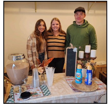
Junior Post-Prom serving Iced Coffee at the Badger Hall