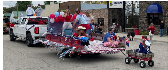
10th Grade Parade float